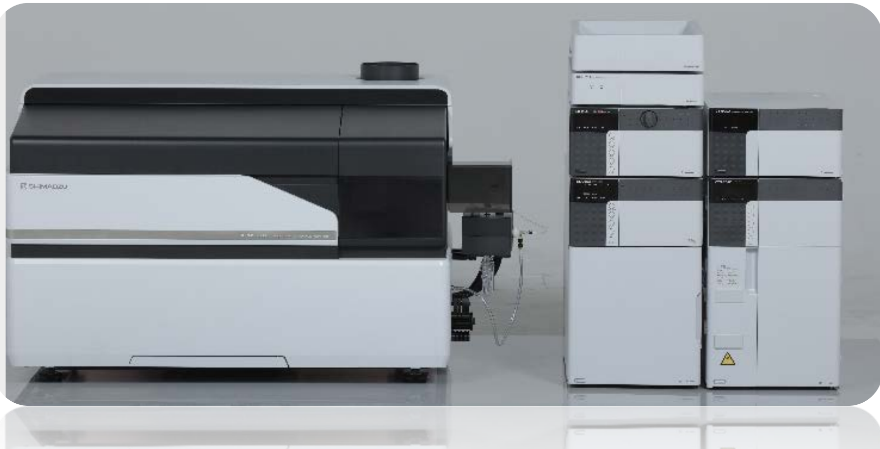
Figure 1: Inductively Coupled Plasma Mass Spectrometer ICPMS-2030 (Shimadzu) connected to the Prominence Inert LC System (Shimadzu)

Food safety is one of the major concerns of the European population and the European Commission is aiming to assure a high level of food safety and animal & plant health within the EU through the farm-to-fork principle. This implements effective control systems for harmful substances such as pesticides, mycotoxins and heavy metals. Nowadays in food control the speciation analysis has become an important tool for the determination of elements like cadmium, chromium, mercury, tin, and arsenic where simply the measurement of the total amount of the element is not sufficient.