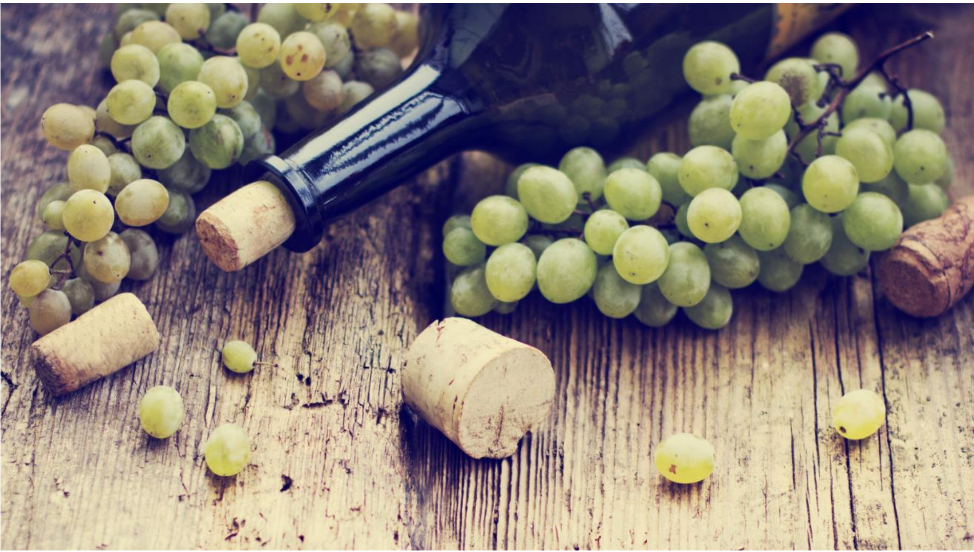
Figure 1: Grapes – the source of wine

Food and drinks are always a hot topic discussion and in the focus of “state of the art” analytical techniques. Food scandals all around the world from eggs to horsemeat, tainted wine, oil, and milk forces the European community to establish an integrated approach on food control. The target is a high level of food safety, animal health, animal welfare and plant health within the European Union through so called “farm-to-table” measures and monitoring, ensuring the effective functioning of the European market.