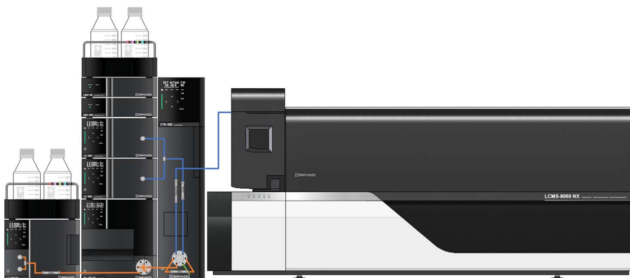
Figure 3 Scheme of the Nexera on-line SPE LCMS-8060NX system