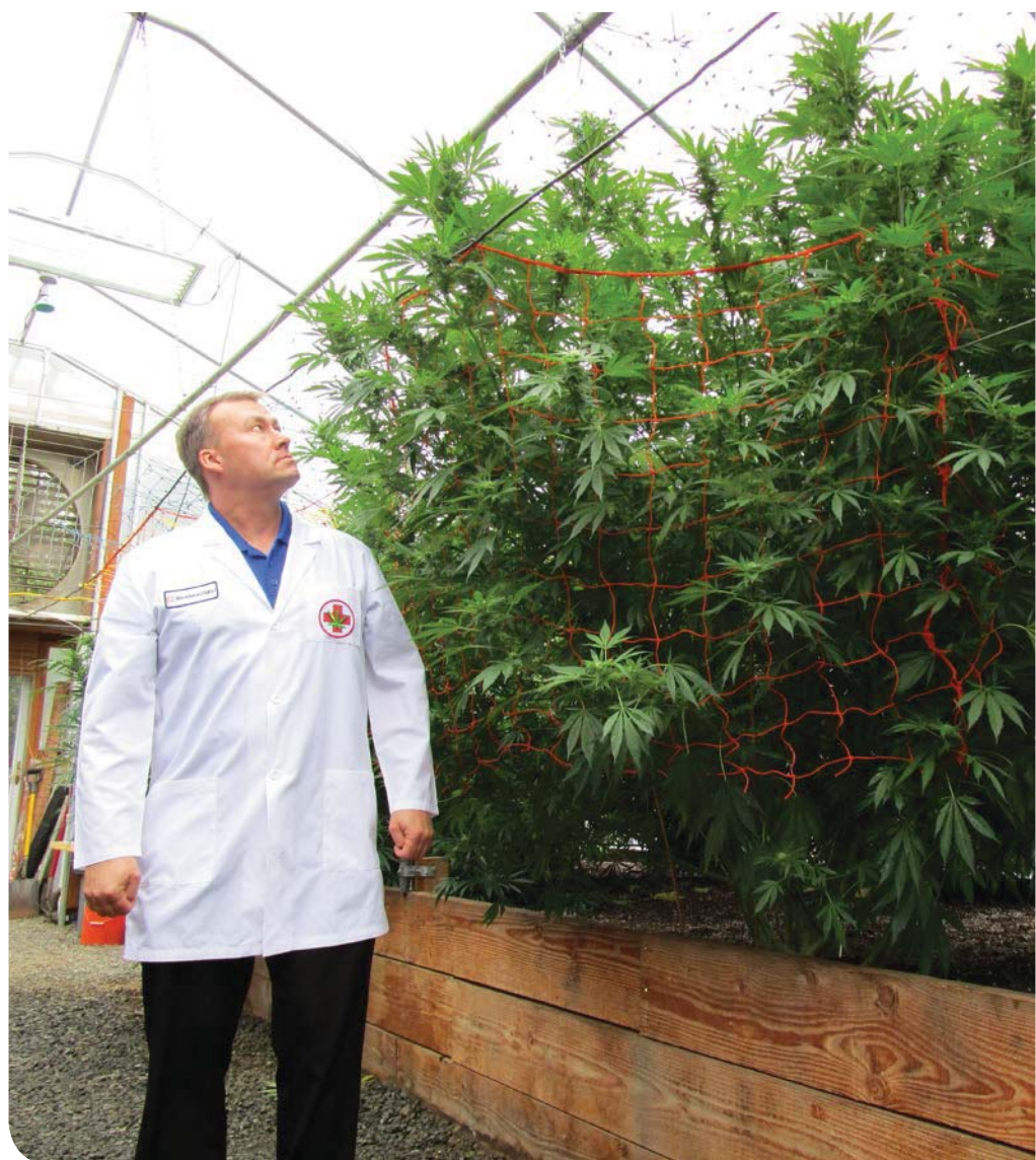
Fig. 1. G.I. Grow's natural sunlight biomedical farm (www.GIGrow.us).

Standardization of testing and sample preparation is critical to ensuring safe products. For example, cannabinoid extraction from cannabis plant materials selectively separates cannabinoids, ultimately delivering them in a highly concentrated form. Concentrated oils and waxes are used to generate a wide variety of cannabis infused products, from gummi bears, brownies, and beverages to soaps and skin creams. Accurate testing of cannabis oils and products is necessary to ensure proper dosing and to minimize the risk of overdose. In addi-